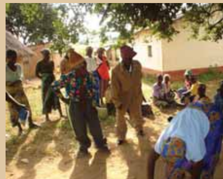
Photo 7: Facilitating community dialogue in Manica, Mozambique through the Food Security, Agriculture and Natural Resources Practice. The Learning and Sharing Practice aims to identify, develop and foster appropriate systems, methodologies, tools and approaches for effective learning.

"...there has been a positive benefit that the DWAF Local Government Support knowledge sharing project has had from utilising the services of a dedicated 'knowledge worker' through Khanya-aicdd. As they are so steeped in learning and sharing, using their services has improved our ability to source learnings from the operational coalface and package them in a manner that encourages others at the coalface to learn – all at a rapid pace..."