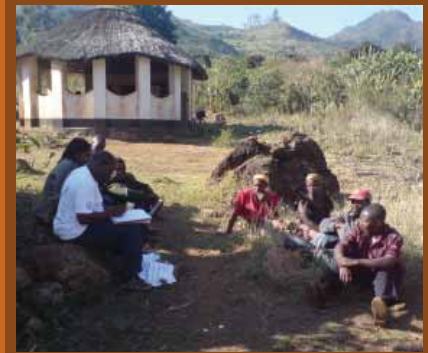
Photo 2: A community consultation in eastern Mozambique. The objective of this practice is to promote planning approaches which are inclusive and participatory and address poverty and livelihoods in Africa.

In 2008-9 we will continue with our community-based planning work, and seek to build more capacity in the organisation to undertake this work. We will recruit a dedicated planner to focus on CBP and local government planning.